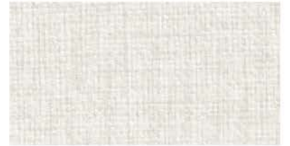
T2-CN-23 Polar Puzzler