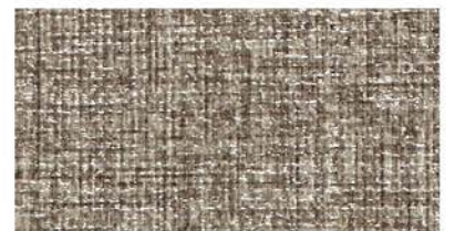
T2-CN-32 Bark in Bind