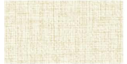
T2-CN-31 Golden Dilemma