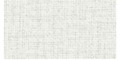
T2-CN-27 Silver Secret