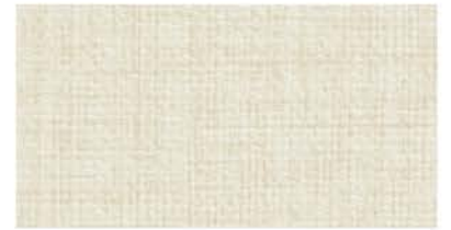
T2-CN-20 Almond Squeeze