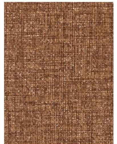
T2-CN-36 Penny Grabber