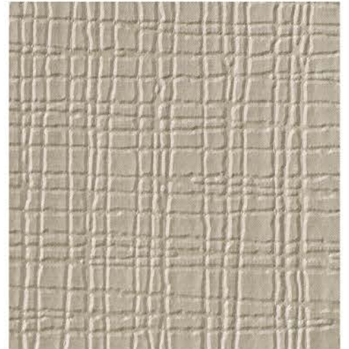
T2-SF-08 Glossy Pewter