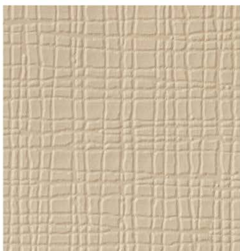
T2-SF-11 Antique Gold