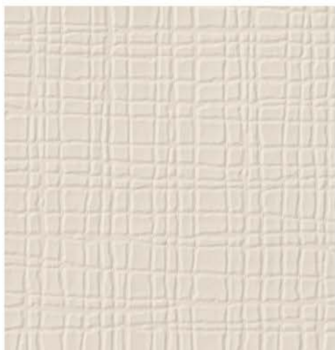
T2-SF-10 Ivory Crepe