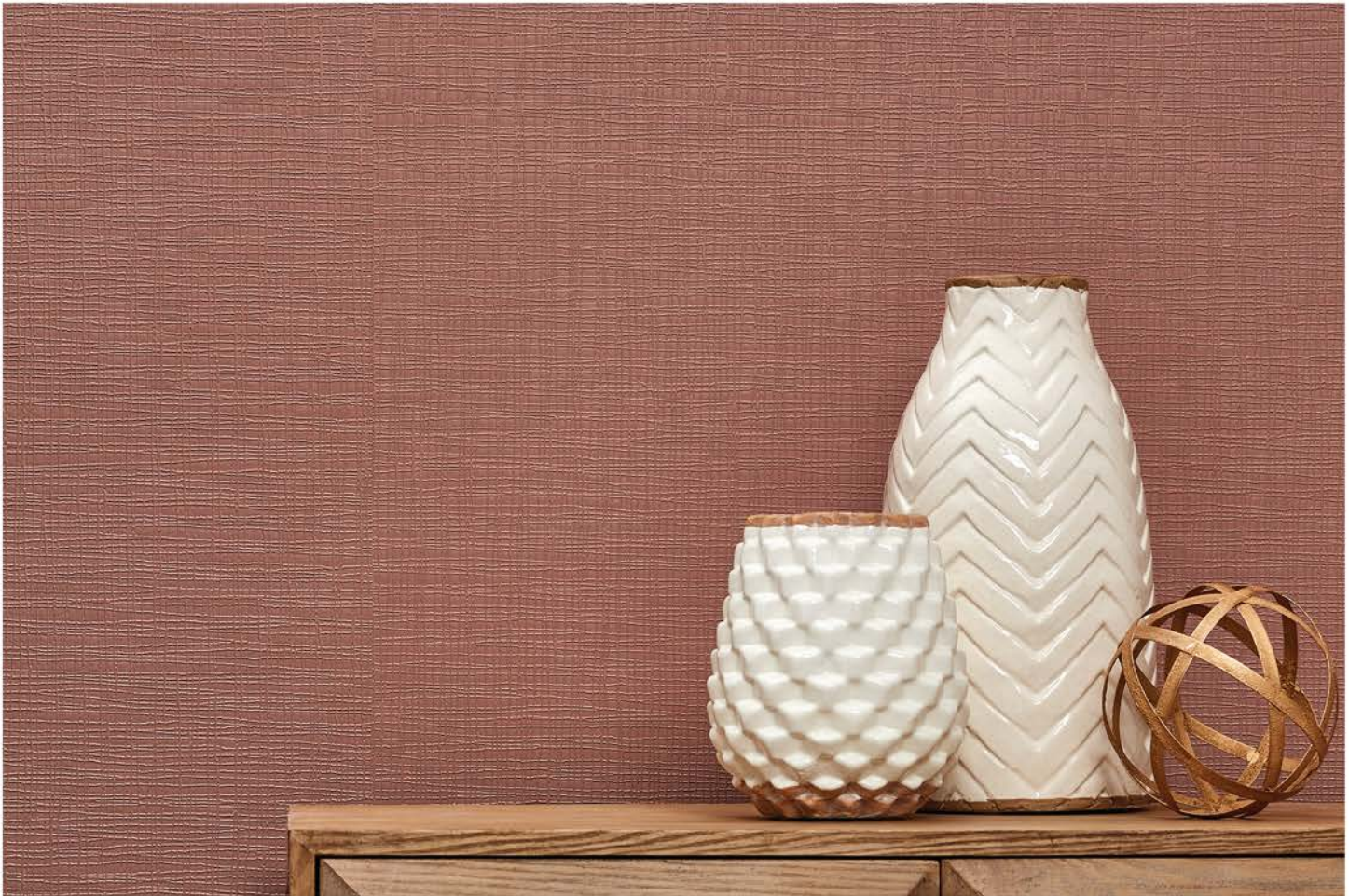
T2-SF-15 Rusty Fabric

50" / Type II / 20 oz. low voc recycled content