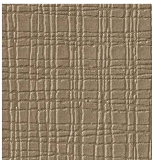
T2-SF-12 Shiny Taupe