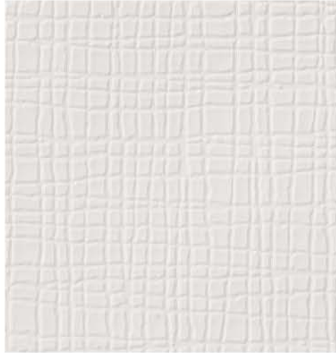
T2-SF-04 Satin White