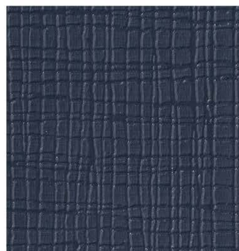
T2-SF-18 Navy Lamour