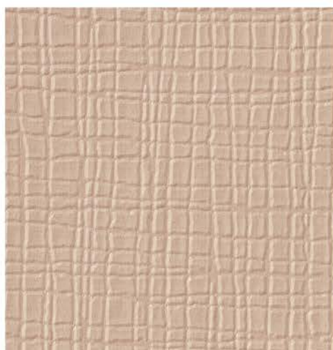
T2-SF-14 Silky Mauve