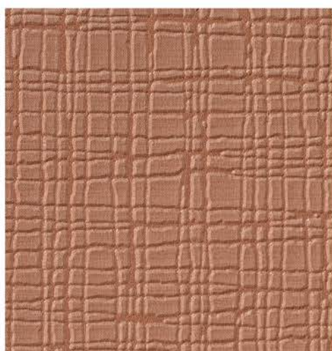
T2-SF-15 Rusty Fabric