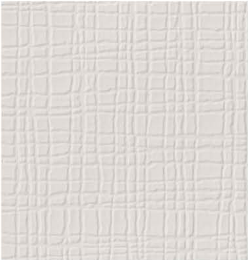
T2-SF-02 Light Grey