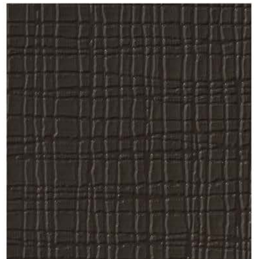
2-SF-09 Matte Black