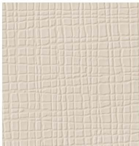
T2-SF-13 Soft Chiffon