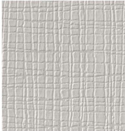
T2-SF-05 Silver Velvet