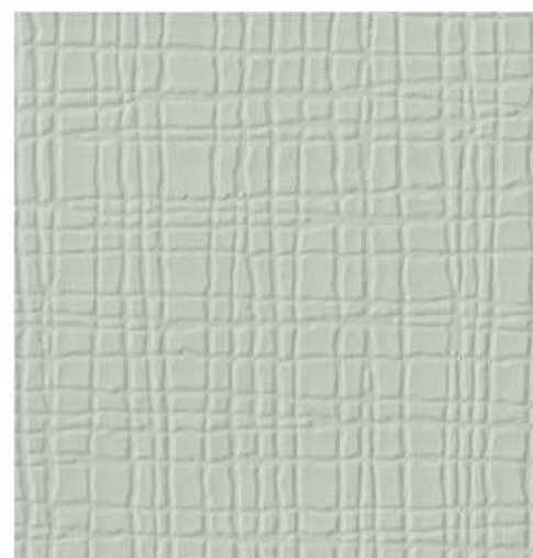
T2-SF-17 Pale Sage